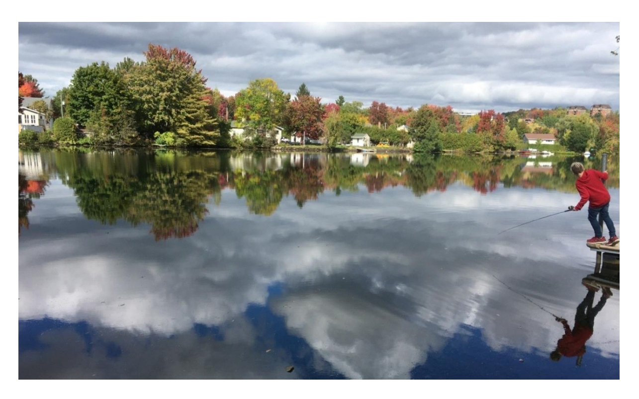
Clouds, trees, fisherman on a river as smooth as a mirror.

With Easter just around the corner, His resurrection is eminent, and with summer at the door, let us welcome this gift from the Lord.